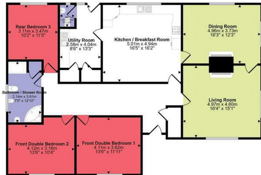
Ground Floor Approx 156 sq m / 1676 sq ft